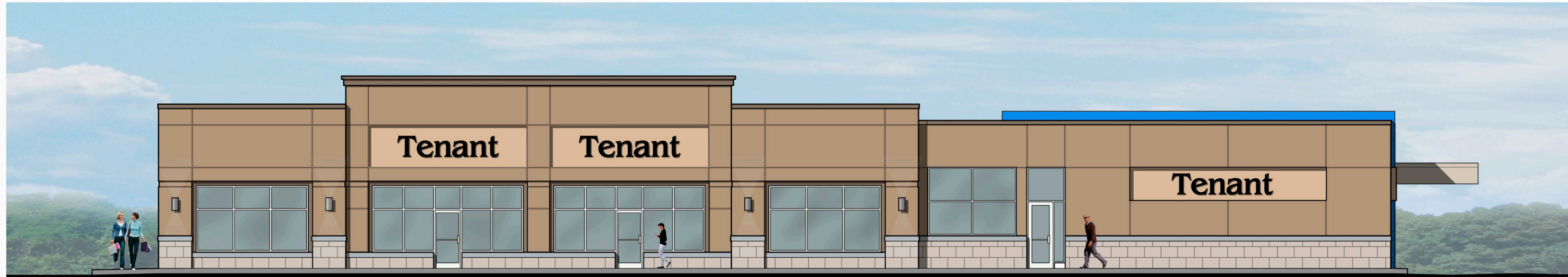
3 SOUTH ELEVATION A-3a 1/8" = 1'-0"