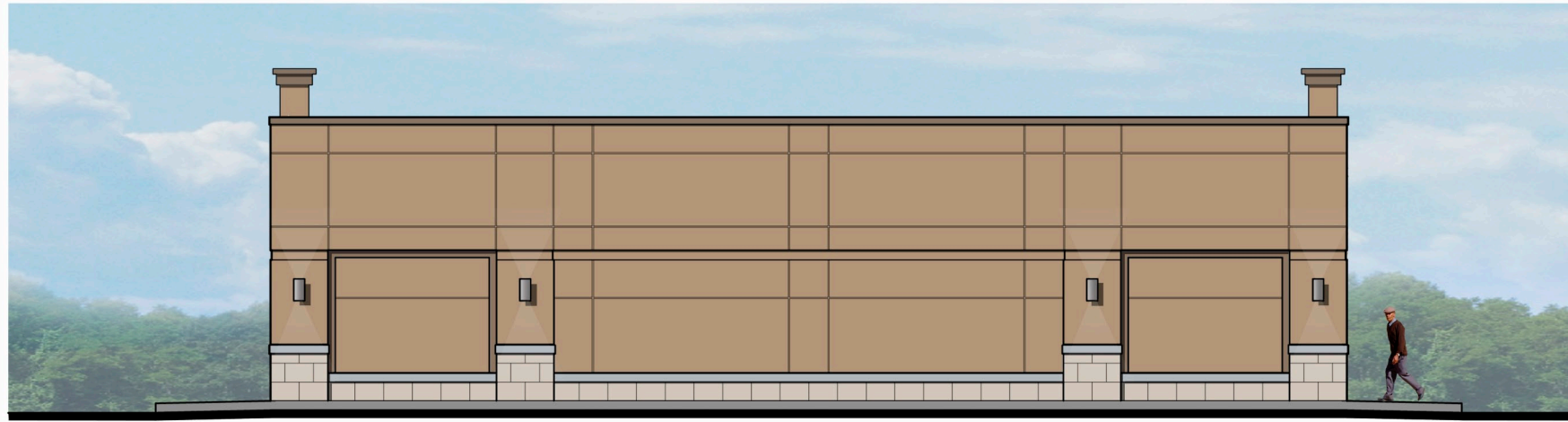
4 WEST ELEVATION A-3a 1/8" = 1'-0"