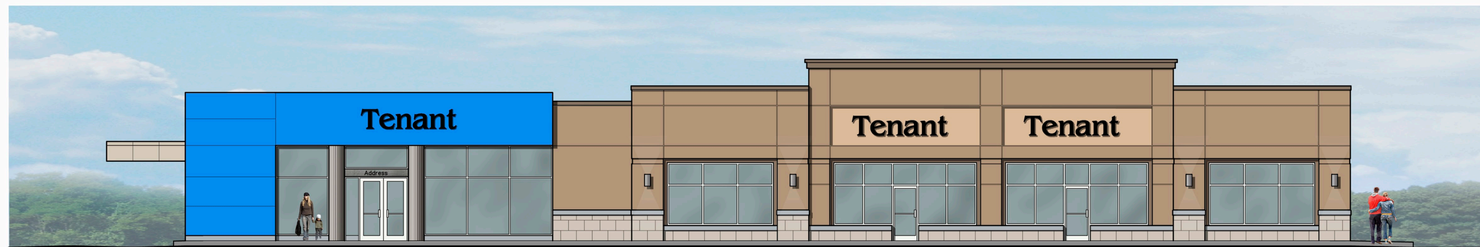
1 NORTH ELEVATION A-3a 1/8" = 1'-0"