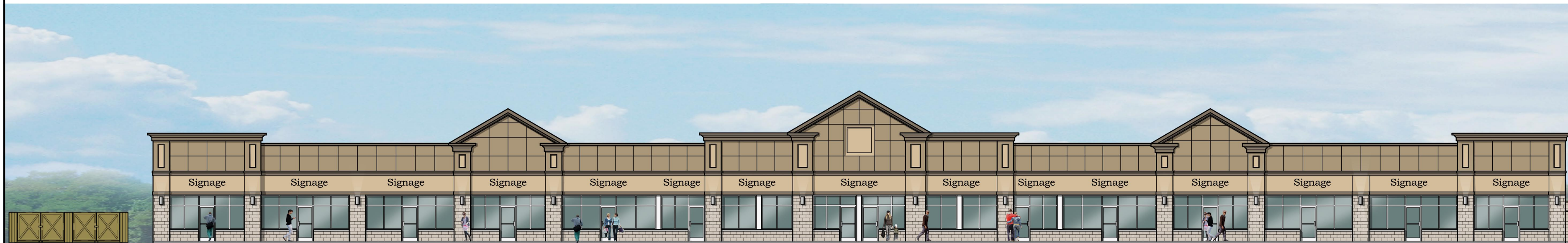
1 EAST ELEVATION A-3c / 3/32" = 1'-0"