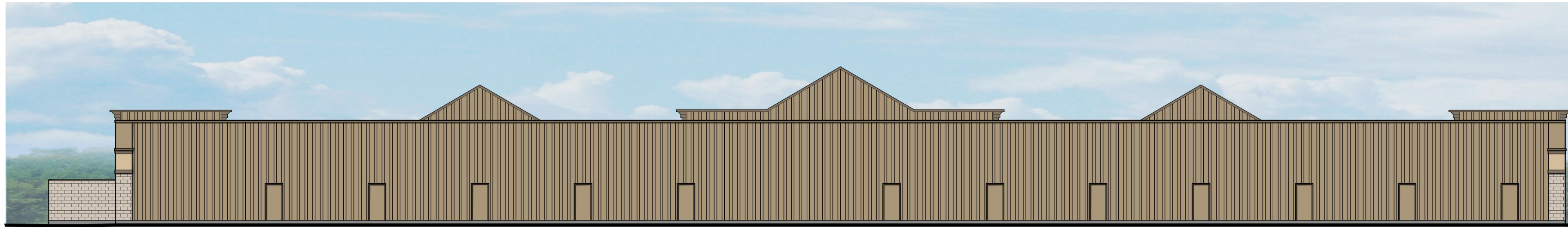
4 WEST ELEVATION A-3c / 3/32" = 1'-0"