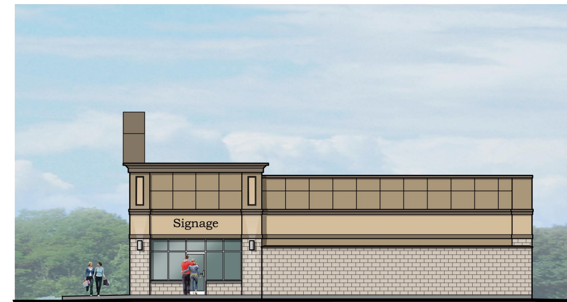
3 NORTH ELEVATION A-3c / 3/32" = 1'-0"