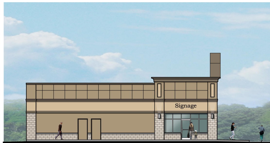
2 SOUTH ELEVATION A-3c / 3/32" = 1'-0"