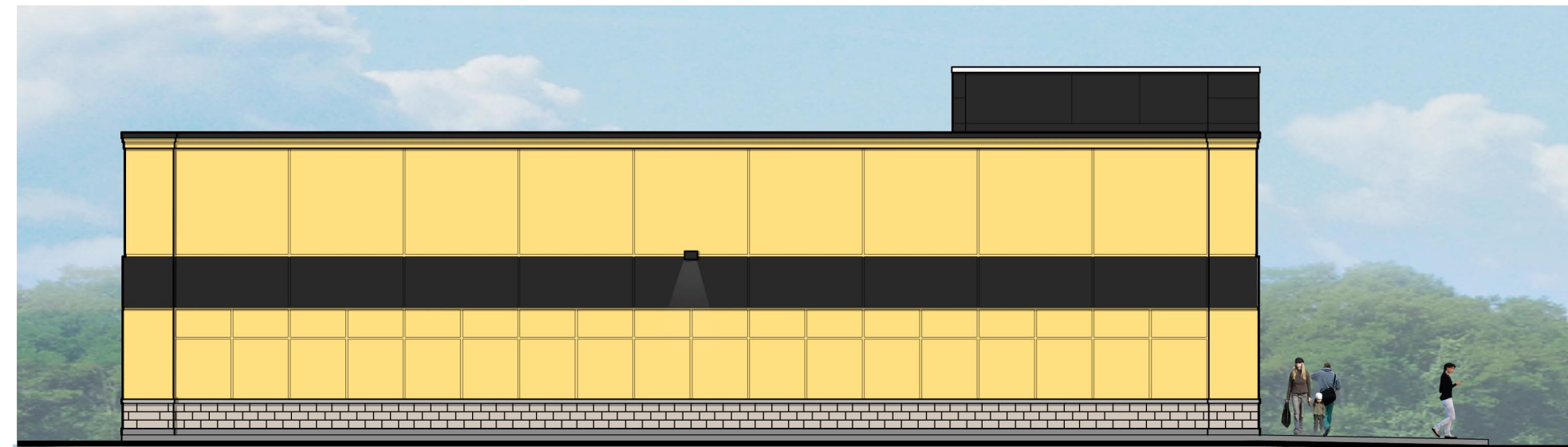
3 WEST ELEVATION A-3c2 1/8" = 1'-0"