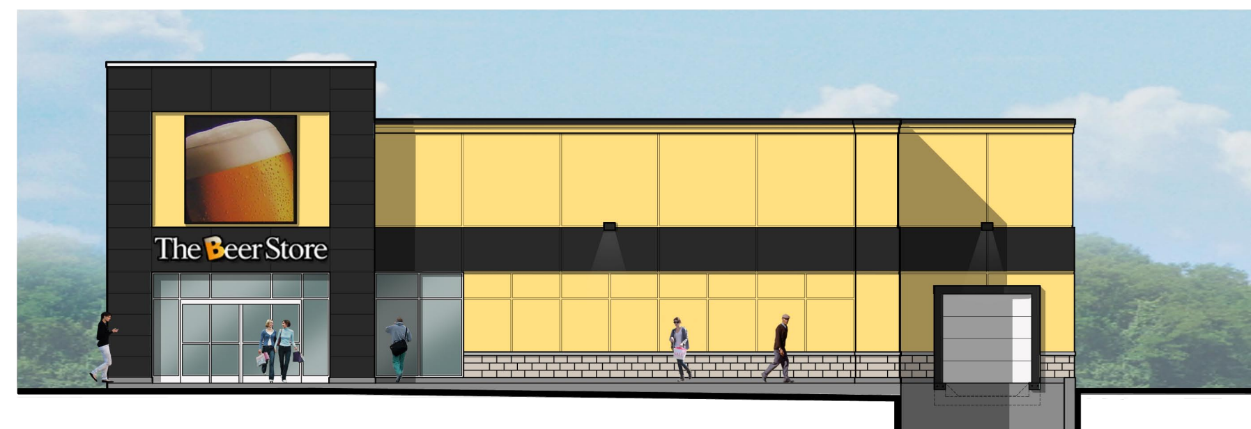
1 EAST ELEVATION A-3c2 1/8" = 1'-0"