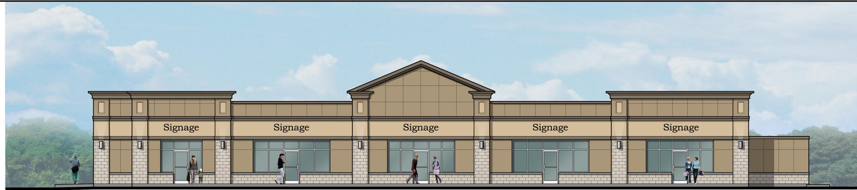
4 EAST ELEVATION - CARP ROAD A-3e 1/8" = 1'-0"