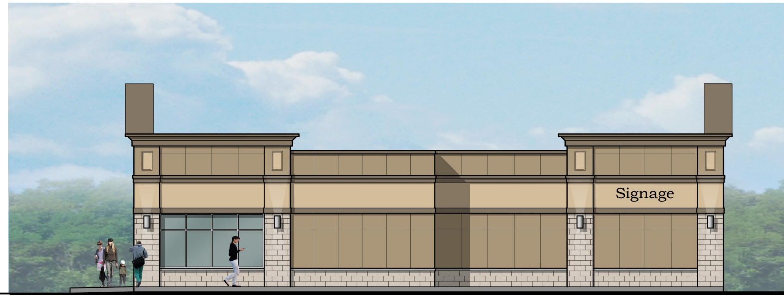
2 SOUTH ELEVATION A-3e 1/8" = 1'-0"