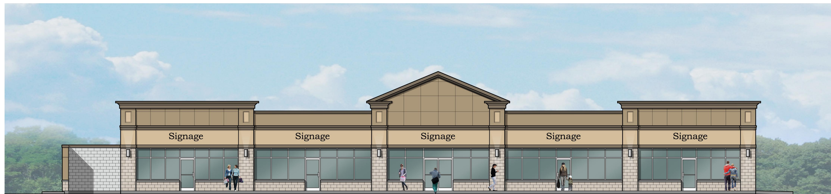
1 WEST ELEVATION A-3e 1/8" = 1'-0"