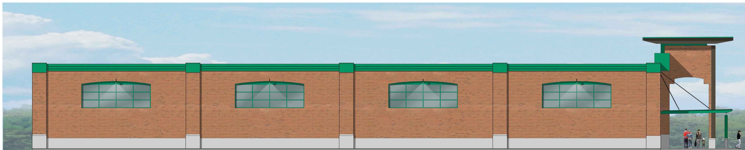
4 WEST ELEVATION - OPTION "B" SK-4 1/8" = 1'-0"