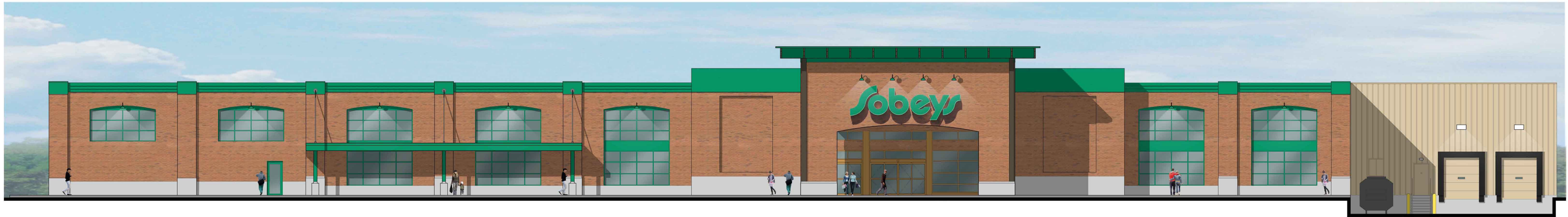
1 SOUTH ELEVATION OPTION "B" SK-4 1/8" = 1'-0"

THE GENERAL CONTRACTOR SHALL CHECK AND VERIFY ALL DIMENSIONS AND REPORT ANY DISCREPANCIES TO THE CONSULTANT PRIOR TO PROCEEDING WITH THE WORK. THIS DRAWING SHALL NOT BE SCALED. THIS DRAWING SHALL BE READ IN CONJUNCTION WITH ALL OTHER RELATED DOCUMENTS & SPECIFICATIONS. ALL DRAWINGS AND RELATED DOCUMENTS ARE THE COPYRIGHT PROPERTY OF THE CONSULTANT, AND MUST BE RETURNED UPON REQUEST. REPRODUCTIONS OF THE DRAWINGS AND RELATED DOCUMENTS IN PART OR IN WHOLE IS FORBIDDEN WITHOUT THE CONSULTANT'S WRITTEN REQUEST.