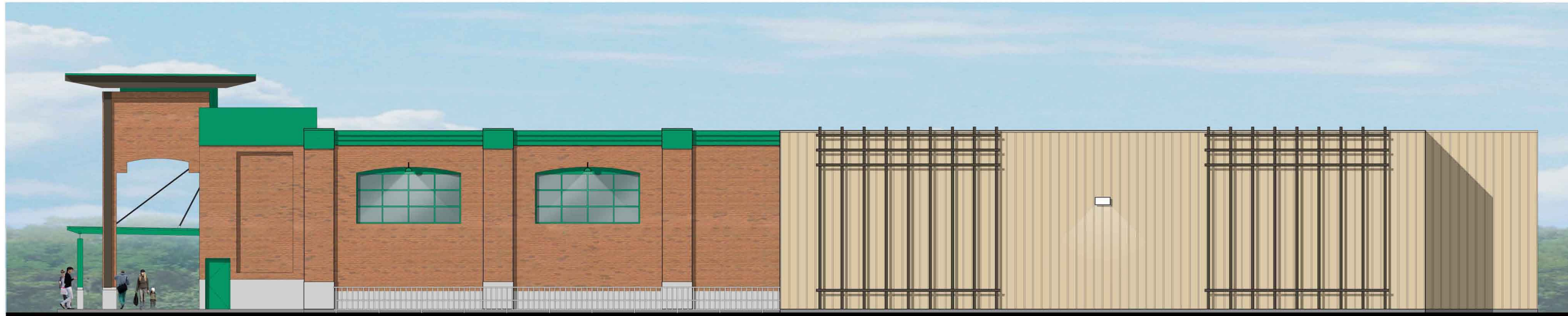
2 EAST ELEVATION SK-4 1/8" = 1'-0"